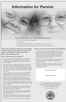
NCHIE Parent Poster: Available at https://nche.ed.gov/resources/

emergency volunteers and confront a high rate of turnover, so ongoing awareness trainings about the McKinney-Vento Act and the services you offer are essential. Local liaisons and State Coordinators must incorporate relief agency staff fully into professional development activities.